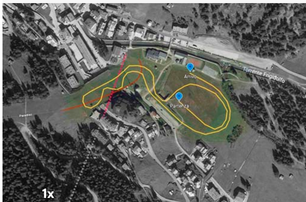
Sprint Free technique 1,4 km